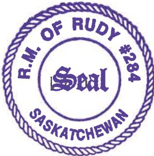
Mayor / Reeve

Read a third time and adopted this 9 th day of July, 2025.